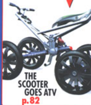
THE SCOOTER GOES ATV p.82